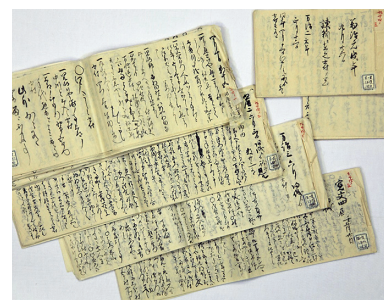
Okayama University Library Collection

Why don't you try researching the living history of the region here, based on these original texts?