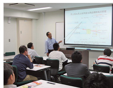
practical lecture in 'accounting fundamentals'

This division strives to train students to assess the range of issues faced by contemporary organizations (corporations, public organizations, government agencies, etc.) from a multifaceted approach encompassing management, accounting, and economics in organization. At the same time, it is imparting training on practical administrative problem resolution. In particular, students of this division are trained to actively engage in a variety of management issues, including strategic planning, human resources, market researches, finance and accounting, etc. The division of Management Sciences in Organization further provides students with opportunities to accede skilled professions, such as certified public accountants and tax accountants. After completion of the course students can earn the master's degree equivalent to the Master of Business Administration (MBA).