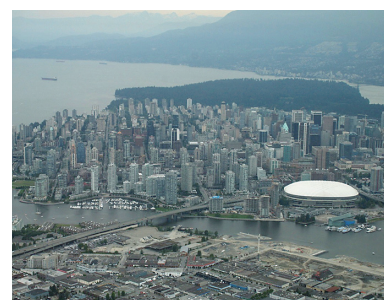
Urban landscape Vancouver- study area

This research environment that allows great freedom, has given many university teachers in recent years. This optimum research is guaranteed not only for those interested in the dynamics of region but to all people striving towards becoming a researcher.