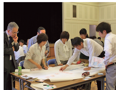
Possibility of cooperation on city planning between Kurashiki city and Kurashiki Central Hospital

We also welcome all the students aiming to become public officials, as long as they have the policy ability to match the needs. Through this course, Okayama University students, local government, business community and NPOs, members of "the network for creation of the region (Agora)", are taking part in researching and debating on the issues of the regional urban development and local medical care.