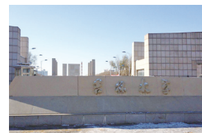
Affiliated University: Jilin University (China)

We offer scholarship to support students who are sent to study at foreign universities, and who are superior in both academic performance and personality.