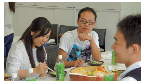
the atmosphere of international exchange party

The centre for East Asia studies has been established for the purposes of promoting education, and academic exchange between East Asia and its neighbouring countries. Another aim of the centre is sharing and dispatching of research results, as well as creation and management of an international academic network. International symposiums, support for exchange students, and those who wish to study abroad are also the role of the centre. This support consists of helping students on writing their thesis, introducing a language partner/ tutor, holding international parties and so on. Personal counselling for those who wish to study abroad is also possible.